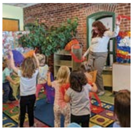
Everyone dances with scarves at Storytime.